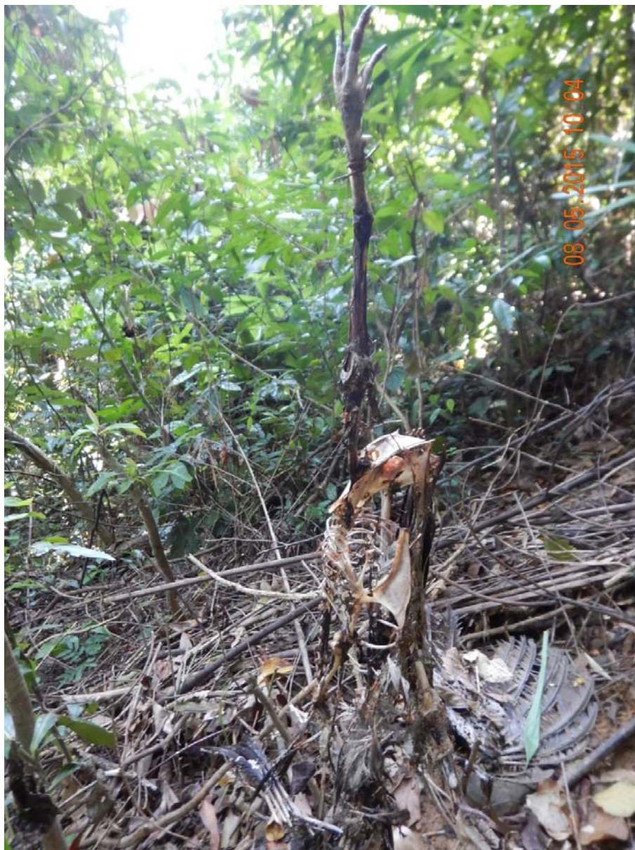
Photo 3: What remains of an unlucky pheasant in an old snare